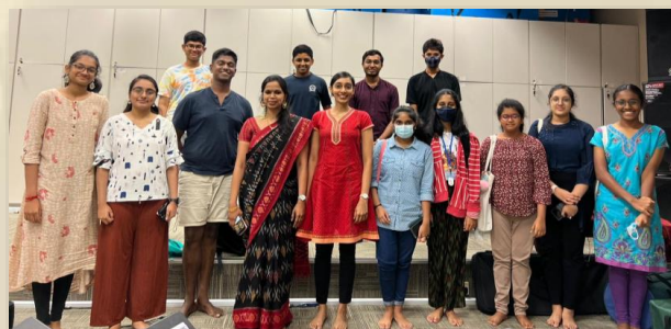
SIOC Youth Wing gearing up for their big show