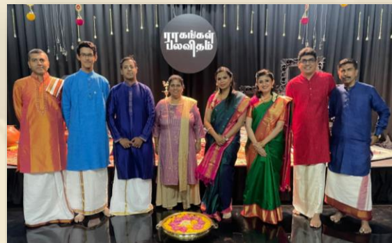
SIOC in Vasantham TV's Deepavali show